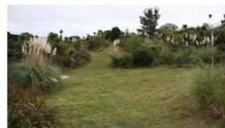
Tracks on our land