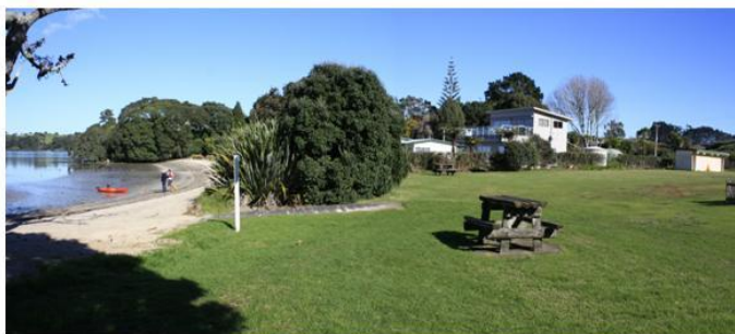
Beach at Matakawau 9 km away