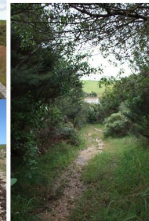
Track to Beach