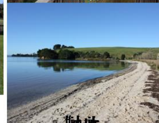
Beach 150m away