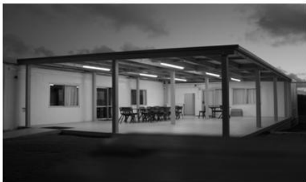
View of covered deck